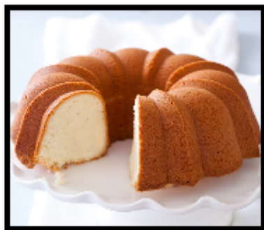
Tressie's Easy Pound Cake

1 box Yellow Cake Mix (Betty Crocker Super Moist) 1 5 oz. box Jell-O Instant Vanilla Pudding 3 large eggs 1/2 c. Vegetable Oil 1 tsp. of 5 different flavorings (any of your choosing) - Butter - Vanilla - Almond - Rum - Lemon 1 c. milk Baking Spray (Baker's Joy) Bundt Cake Pan