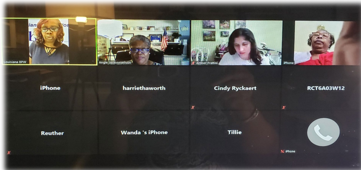
Fall District Meeting, November 14, 2020