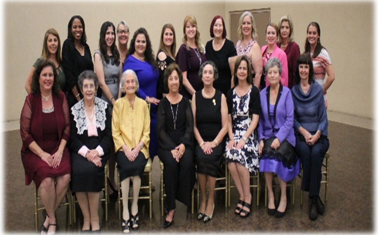
St. Bernard Parish – 2019 Man and Woman of the Year Gala