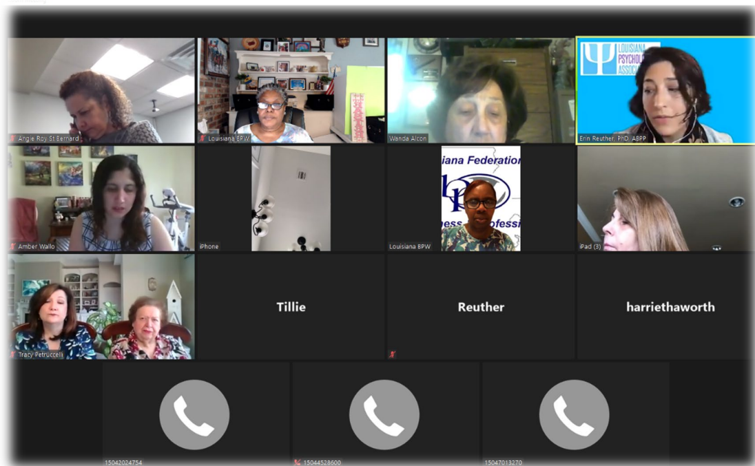
Spring District Meeting, March 13, 2021