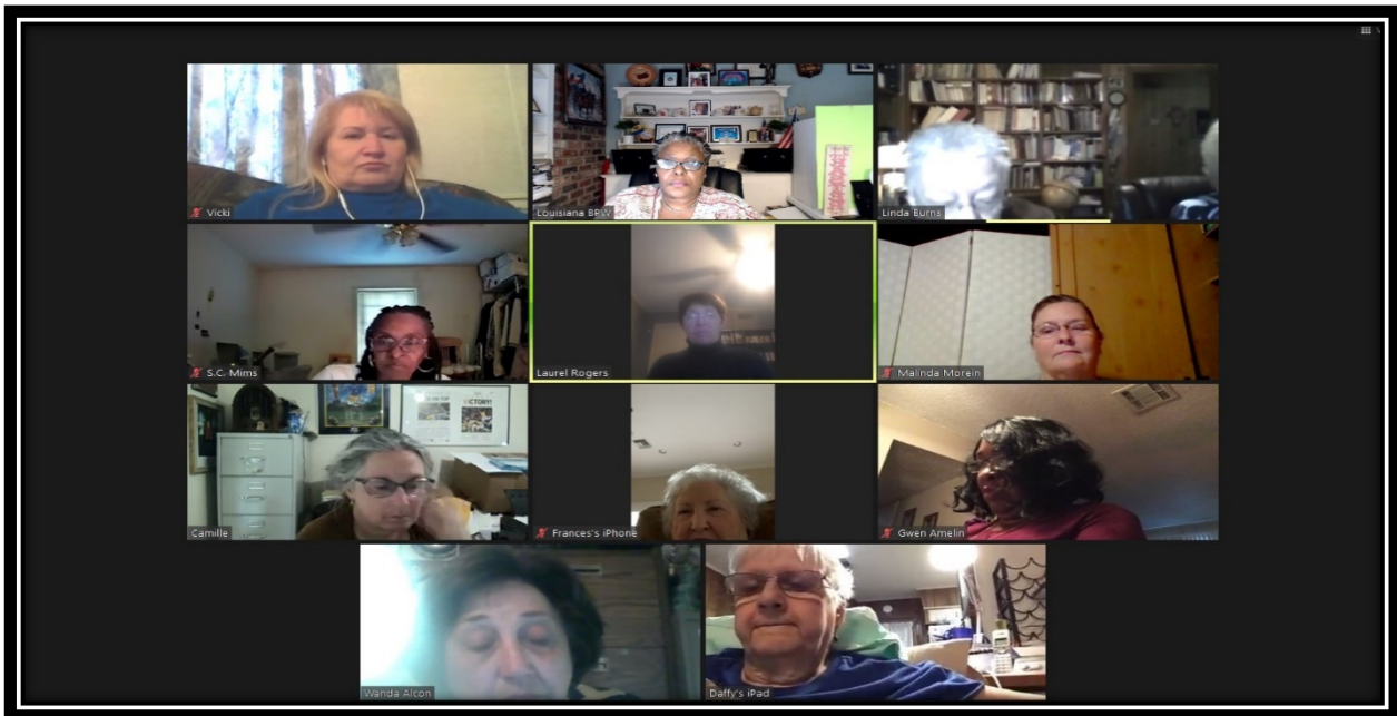
Spring District Meeting, March 18, 2021