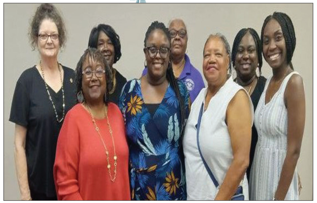
August meeting and birthday celebration.