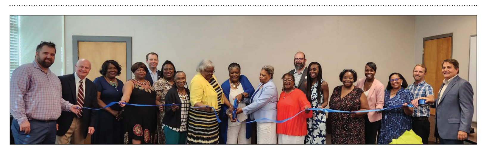
The Monroe Chamber of Commerce ribbon cutting and BPW Founder's Day Celebration.

Let's celebrate Women's Equality Day 2023 by Embracing Equity!