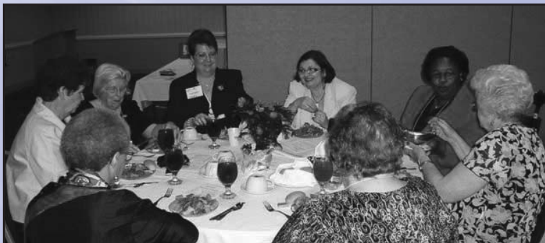
Ladies from around Louisiana are networking at Saturday's Banquet.