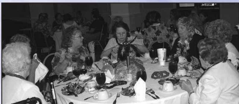
Ladies from around Louisiana are networking at Friday's Fun Night.