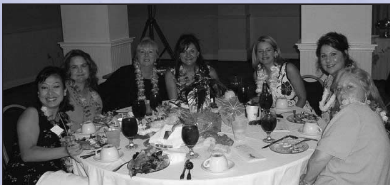
Ladies from West St. Tammany are networking at Friday's Fun Night